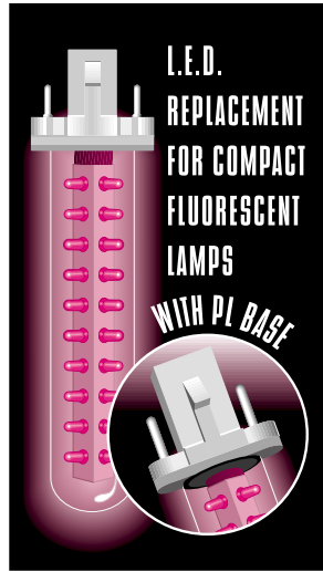
TRIAD Fluorescent Retrofit