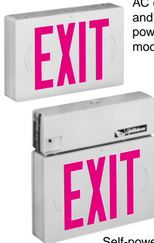
Self-powered UX2E series