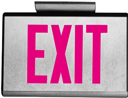
New Compact Design and Diagnostic/Self-Test Feature