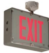
Severe™ XVHZ & XVEHZ Exit series PG. 52-53