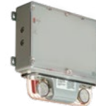
Severe™ VH Battery unit PG. 112-113