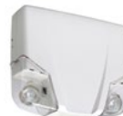
Grande™ Battery series PG. 90-91