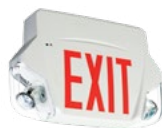
Grande™ Combo series PG. 38-39