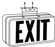
Ceiling mount (flush ceiling)