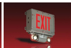
Severe™ XVH Combo Series p.46