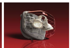
Severe™ ELF651 Remote Series p.113