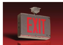
Severe™ XVHZ & XVEHZ Exit Series p.44

The Severe™ VH Battery Unit is part of the Severe™ family of Class I Division 2 rated emergency lighting products. Extremely resistant to strong impacts, vibrations and variations in temperature, this family of products is ideally suited for areas with the risk of the presence of flammable gases, or vapors or liquids able to create an explosive gas atmosphere.