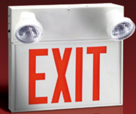
Shown with ELF2 (suffix 2M) Heads

20 gauge steel LED Exit Sign and Combination Unit designed for easy installation. Energy efficient and rugged in design.