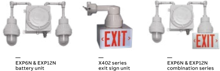
EXP6N & EXP12N battery unit