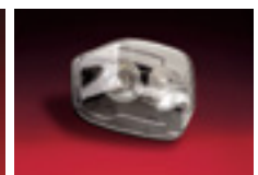
Severe™ ELF650 Remote Series p.111