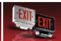
Severe™ XV Combo Series p.42