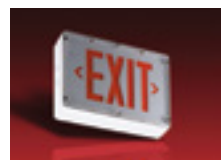
Severe™ XV Exit Series p.40

The Severe™ XV Series Battery Unit is part of the Severe™ family of NEMA-4X rated emergency lighting products. The Severe™ family offers complete emergency lighting solutions for commercial and industrial environments where protecting against humidity, dust, water infiltration and the risk of vandalism are specification criteria.