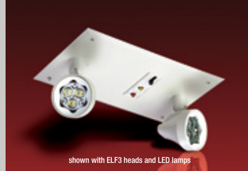
shown with ELF3 heads and LED lamps

Designed for fully recessed installation in walls or ceilings