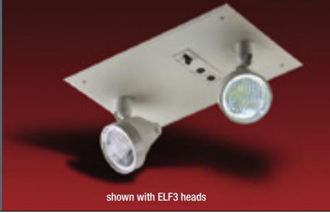
shown with ELF3 heads

Recessed Steel Housing 6V up to 36W, 12V up to 36W Capacities Lead-Calcium or Nickel-Cadmium battery