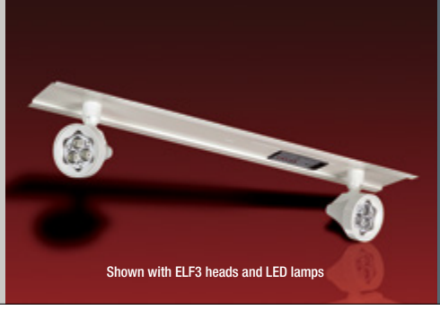
Shown with ELF3 heads and LED lamps

Designed for unobtrusive use in T-Bar ceilings. The off-white, fully recessed housing harmonizes with ceiling designs