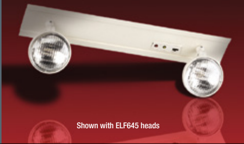
Shown with ELF645 heads

Recessed Steel Housing 6V up to 81W, 12V up to 110W, 24V up to 110W Capacities Lead-Calcium or Nickel-Cadmium battery