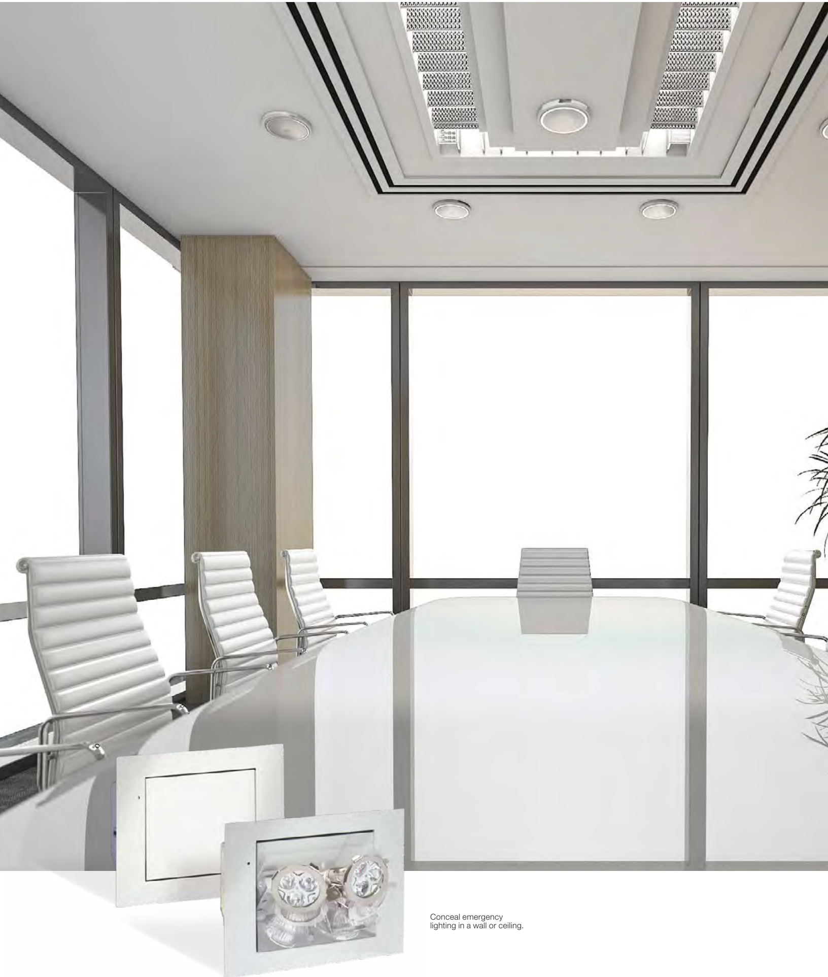
Conceal emergency lighting in a wall or ceiling.